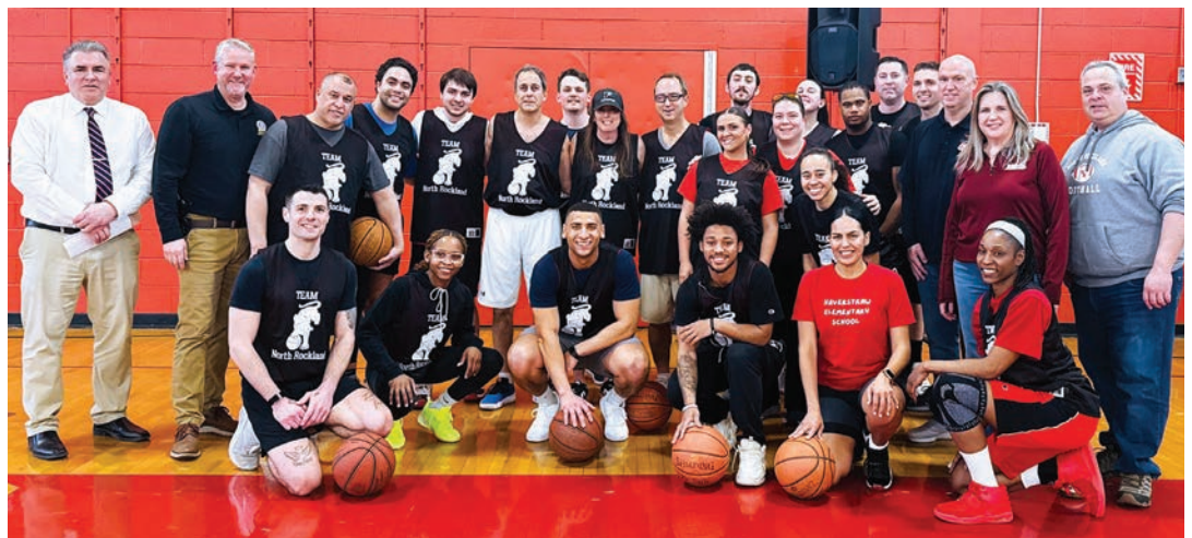
The Stony Point PAL hosted an unforgettable showdown between Team North Rockland and the Harlem Wizards on March 19th.

The Stony Point Police Department remains steadfast in its commitment to responding to community concerns, working collaboratively with our law enforcement partners, and upholding the safety and integrity of our town. ■