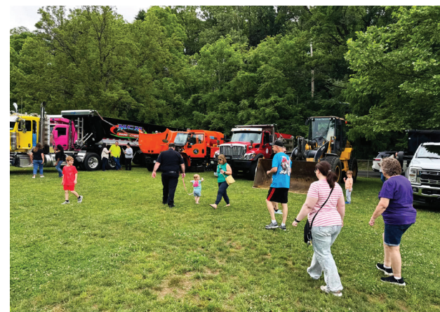
Families enjoyed the Stony Point PAL Touch a Truck and Bike Safety event in June.