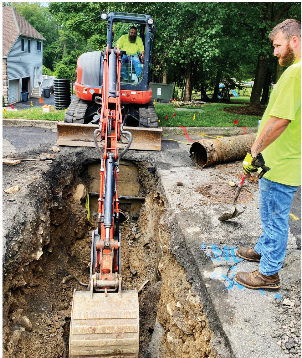
Stony Point Highway Department employees replacing drainage piping in town.

Thank you for your cooperation in protecting our wastewater system! ■