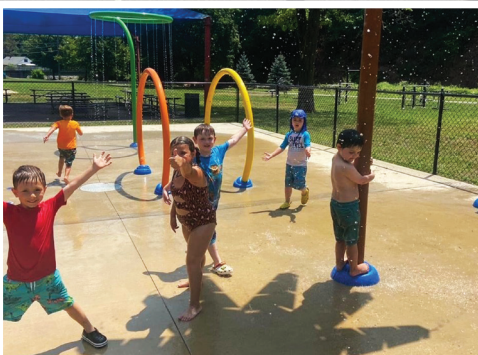
Pictured Right: Campers enjoyed their day at Bounce in Valley Cottage.