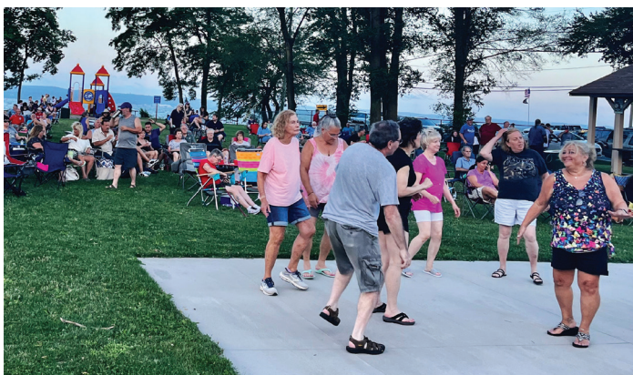
Our summer concerts at Riverfront Park draw a big crowd!