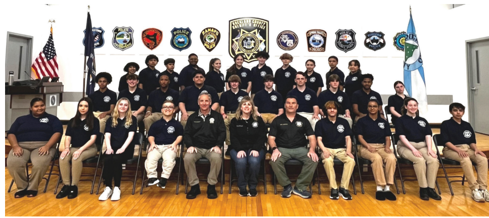
The 26th class of the North Rockland Youth Police Academy.