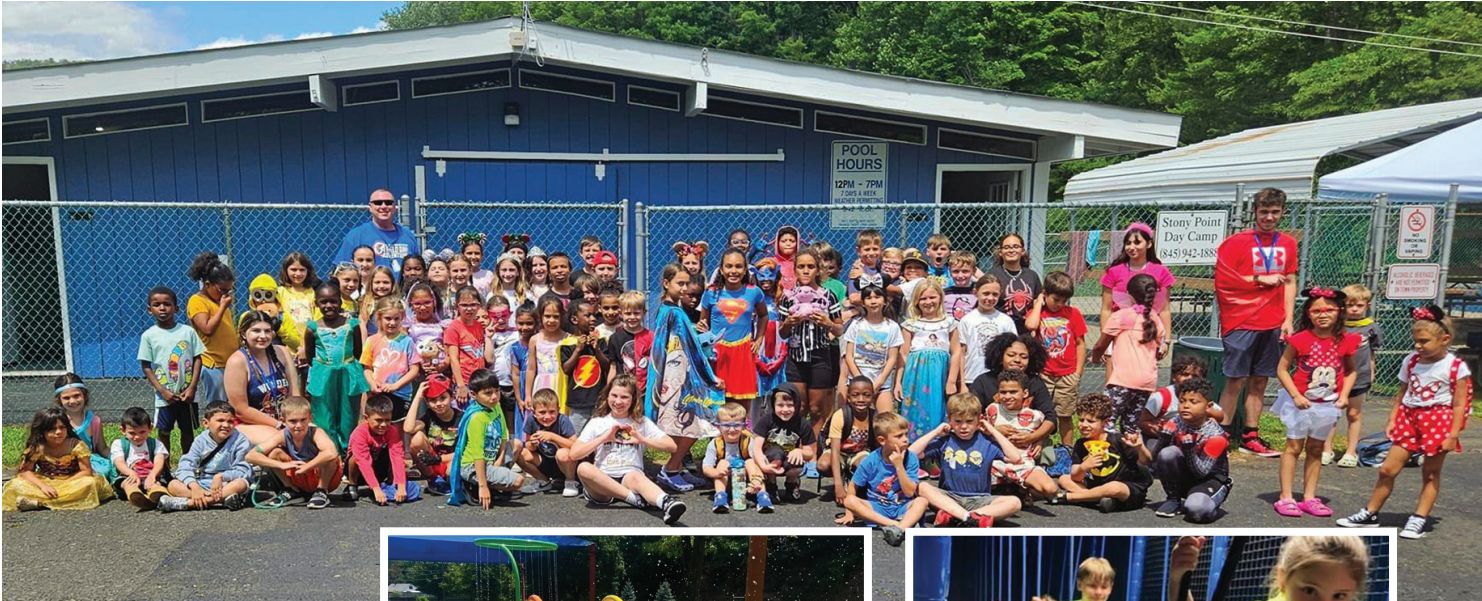
Pictured Left: Children in our Playground Program cool off at the splash pad.