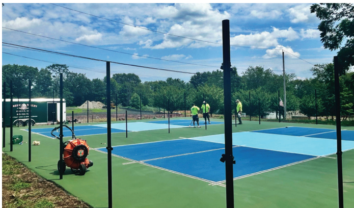
Construction is well underway on two additional pickleball courts at Veterans Memorial Park.